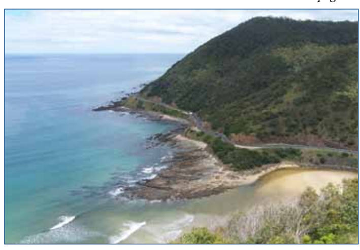
Great Ocean Road, Victoria, Australia