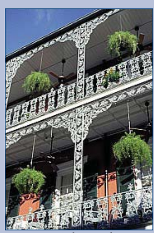
New Orleans.

The 2009 CNS Annual Meeting in New Orleans, La., Oct. 24-29, well attended. The meeting occurred immediately after the meeting of the Society for Neuro-oncology and the AANS/CNS Section on Tumors in New Orleans. This was the first time that the Tumor Section collaborated with the SNO to hold a joint meeting, and the concept was well received. The idea of combining the Tumor Section Biennial Tumor Satellite Symposium with the fall annual SNO