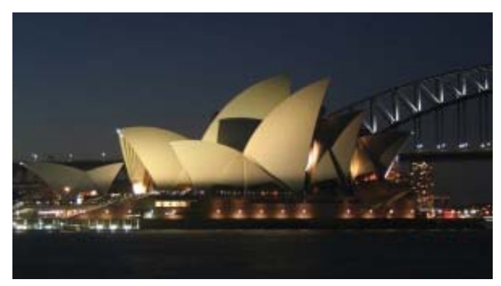
Sydney Opera House at Night