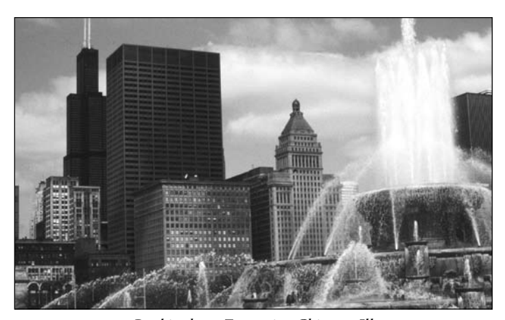
Buckingham Fountain, Chicago, Ill.

Description: Local delivery methods for adjuvant therapy of intrinsic brain tumors have evolved from experimental studies into standard of care treatment. In this practical update a wide range of local delivery modalities will be discussed including polymers, convection, blood brain barrier disruption, endovascular techniques and local delivery of radiation. Practical examples of clinical applications for each of these methods will be reviewed, and the current status of experimental therapies in clinical trial will be discussed. At the conclusion of the course, participants will have a refined understanding of what delivery methods are currently available for standard of care treatment, and what methods are currently in later stages of clinical development. A review of clinical trial results, ongoing clinical trials and centers of participation will be provided as well.