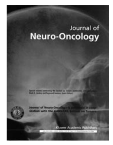
FIG 1 Cover of the Special 20th Anniversary Issue of the Journal of Neuro-Oncology, officially cited as Journal of Neuro-Oncology Volume 69, Numbers 1-3, August/ September (I,II), 2004.

Originally conceived as a two-volume special issue, the final version consisted of a single large 350-page volume. It includes the first peer-review publication of an official history of any AANS/