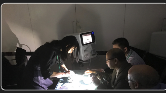
FRIDAY 13 JULY HANDS-ON WORKSHOPS