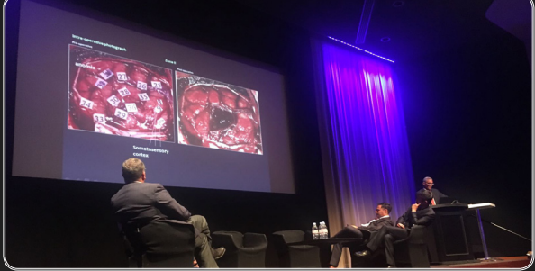
SUNDAY 15 JULY DISCUSSIONS, DEBATES & COMPLICATIONS