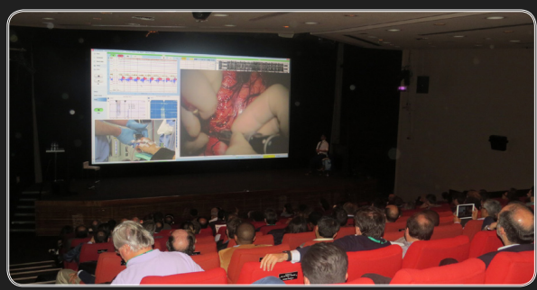
THURSDAY 12 JULY 10 LIVE SURGERIES